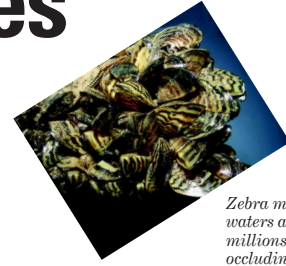
Zebra mussels invaded U.S. waters and have caused millions of dollars of damage by occluding pipes in municipal and industrial raw-water systems

The negative consequences of invasive species are far-reaching, costing the United States billions of dollars in damages every year. Compounding the problem is that these harmful invaders spread at astonishing rates. Such infestations of invasive plants and animals can negatively affect property values, agricultural productivity, public utility operations, native fisheries, tourism, outdoor recreation, and the overall health of an ecosystem.